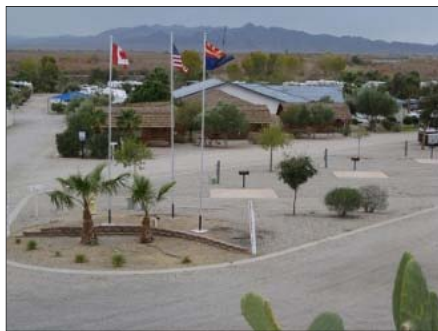
Colorado River Oasis Ehrenberg (Blythe), AZ $5,890,000 - 260 Spaces