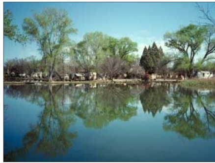
Twin Lakes St. David, AZ $3,250,000 - 217 Spaces