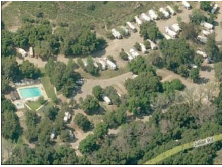
Ramona Canyon San Diego County, CA $3,150,000 - 126 Spaces