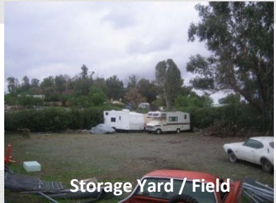
Storage Yard / Field