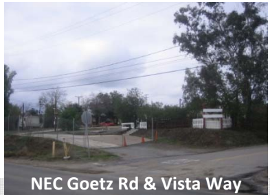
NEC Goetz Rd & Vista Way

On City Water Connect to City Sewer Or Use Septic Field Existing Infrastructure & Underground Utilities